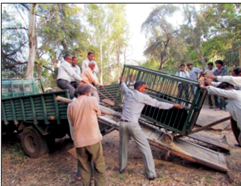
Fig. 3: Sloth bear rescue.

The bear ingression in nearby villages were also analysed on the basis of time of attack, which shows that majority of incidents occurred during the day time. Further it was also recorded that maximum conflicts occurred in winter season (Table 1). Winter is the fruiting season of most of the plants occurring in the study area, these fruits are consumed by sloth bears. Result shows that maximum conflicts are in the form of road accidents (Fig. 4).