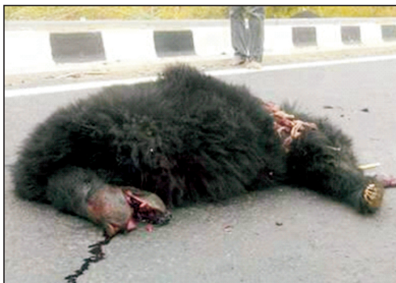
Fig. 2: Road accident.