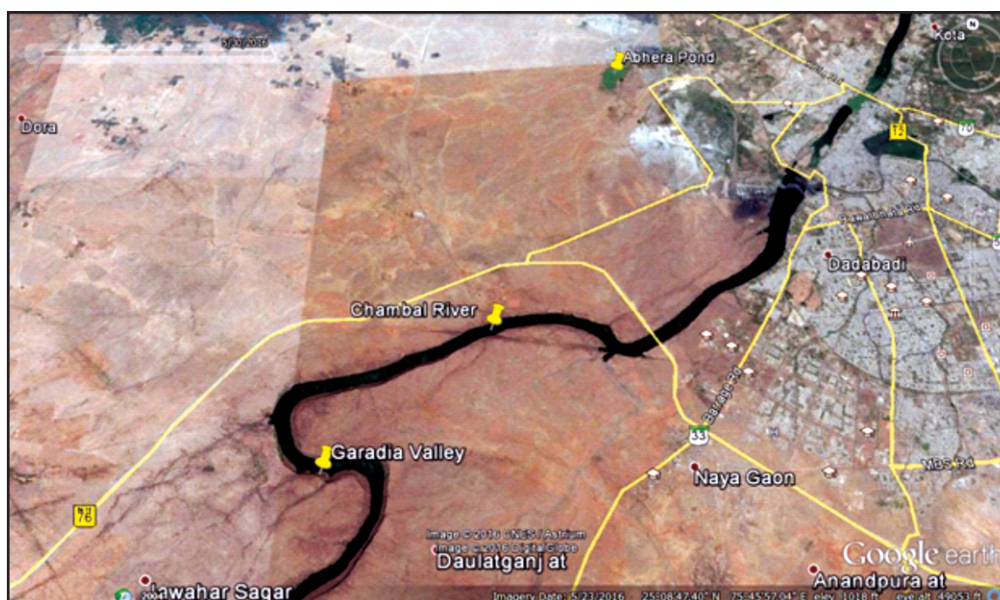
Fig. 1: Map showing study area.