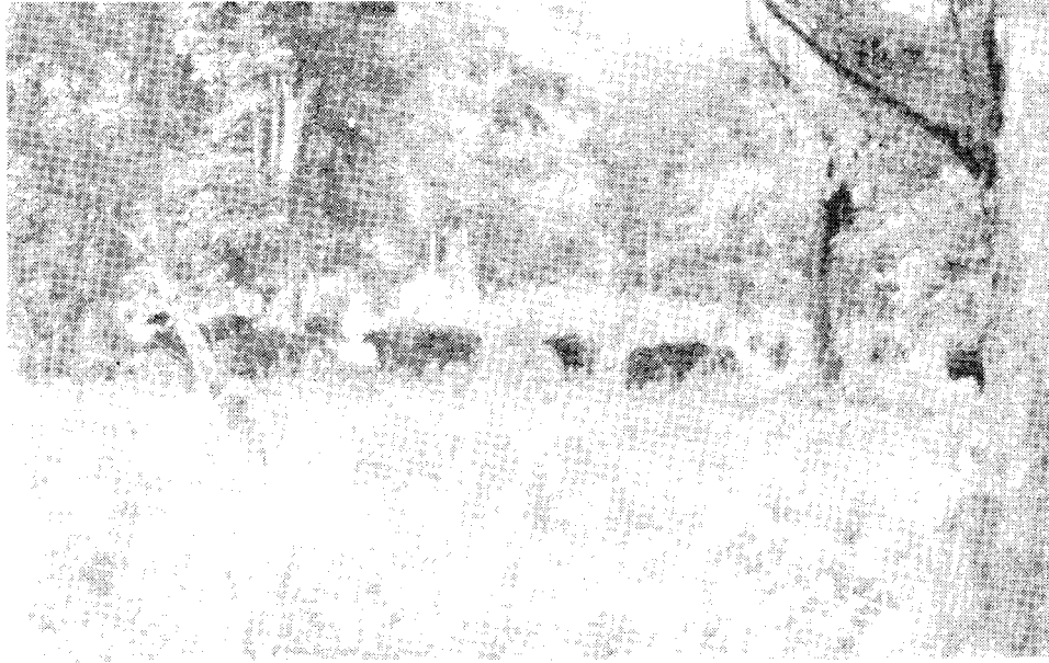
Gaur herd in fodder grass plantation - Garumara NP

Out of the total 79.45 km 2 only 750 ha of natural grassland can be considered as suitable habitat for the Great Indian One-horned Rhinoceros Rhinoceros unicornis . Severe restriction of grazing area automatically limits the scope of population growth and sustainability of larger population in Garumara National Park.