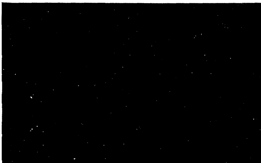
Transition of habitat within Garumara National Park

The process of overwood removal followed by artificial regeneration for maintaining grassland habitat is an extremely important component of management. It is to be done in grassland dominated areas invaded by pioneer species like Khair ( Acacia catechu ), Sissoo ( Dalbergia sissoo ), Semul ( Bombax ceiba ), Tantari ( Dillenia indica ), Malata ( Macaranga denticulata ), Sidha ( Lagerstroemia speciosa ).