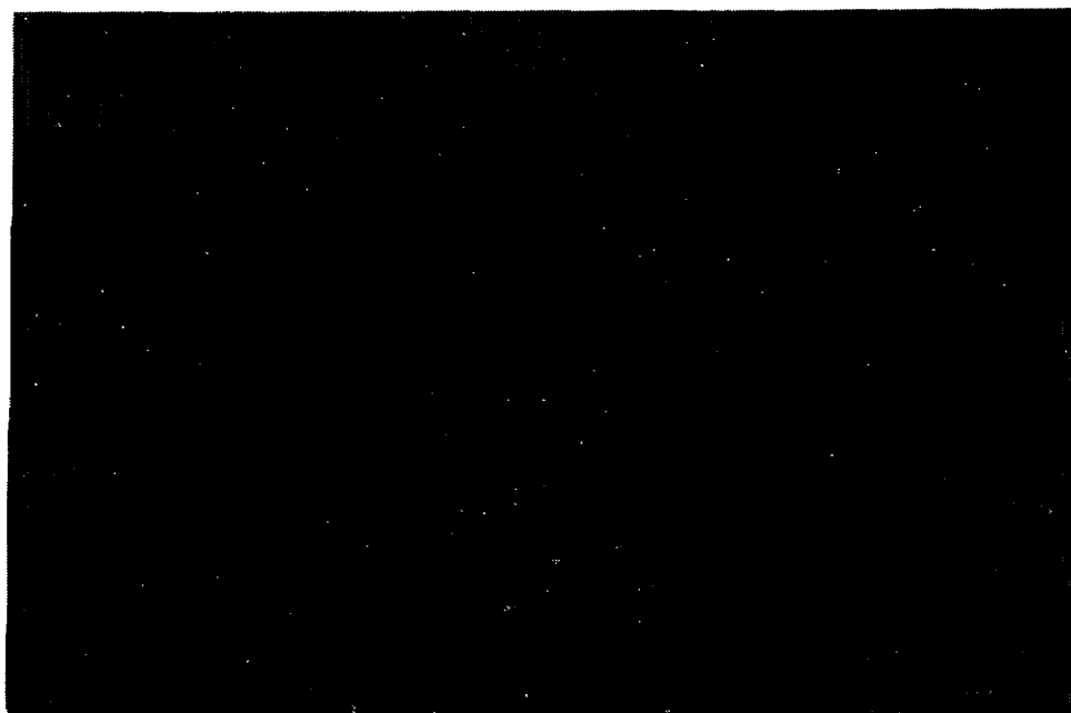
Rhino Bull inside fodder grass plantation - Garumara NP

other than protection measures are prescribed in this zone.