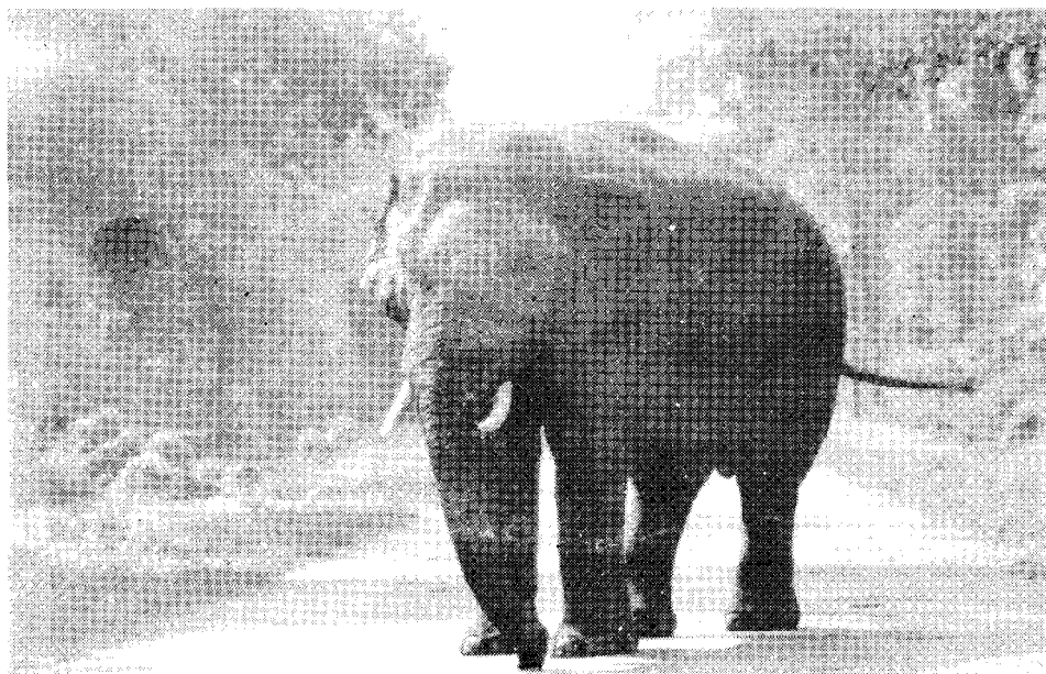
Bull Elephant crossing highway along Garumara NP

then sanctuary area and was killed at Kathambari, about 15 km, from Park.