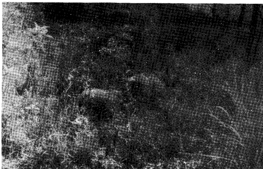
Rhino mother with calf grazing in grassland of Garumara NP

13. Man - Animal conflict :- Straying of wild animal from the protected area into the adjoining areas is a persistent problem. The straying of wild animals occur in the following forms -